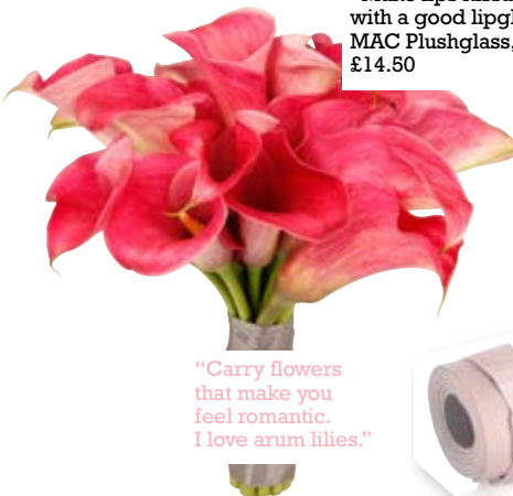
"Carry flowers that make you feel romantic. I love arum lilies."