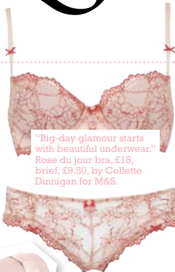
"Big-day glamour starts with beautiful underwear." Rose du jour bra, £18, brief, £9.50, by Collette Dinnigan for M&S.