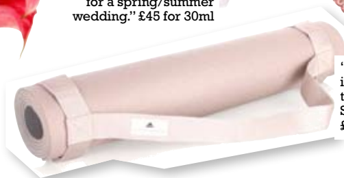
"Try calming yoga if wedding planning is taking its toll." Adidas by Stella McCartney yoga mat, £35, net-a-porter.com