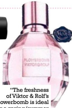
"The freshness of Viktor & Rolf's Flowerbomb is ideal for a spring/summer wedding." £45 for 30ml